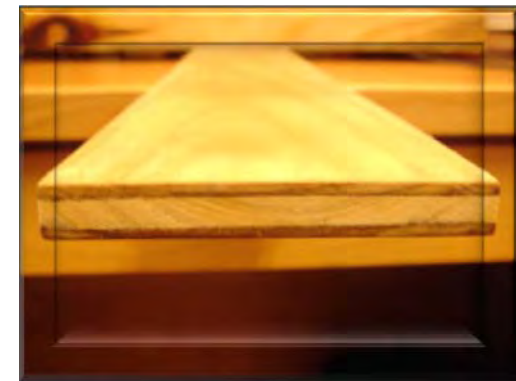
3-layer VTC composite